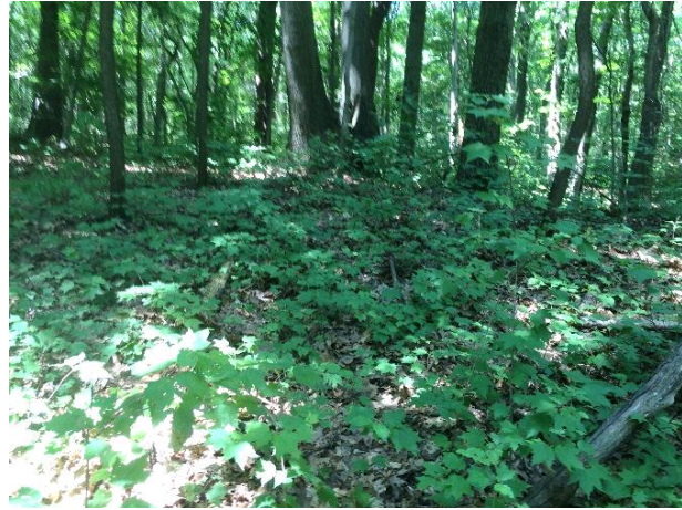
Two forested parks in New York City. The photo on the left shows severe deer damage; the photo on the right shows a healthy understory.

High-density populations can also harm the deer themselves by increasing competition for food and transmission of diseases and parasites. Deer in lower-density populations tend to be in better physical condition (Keyser et al., 2005), all else being equal, because there is more food available to them. Because they don't come in contact with as many other deer, they are less likely to be infected with parasites or diseases (Storm et al., 2013).