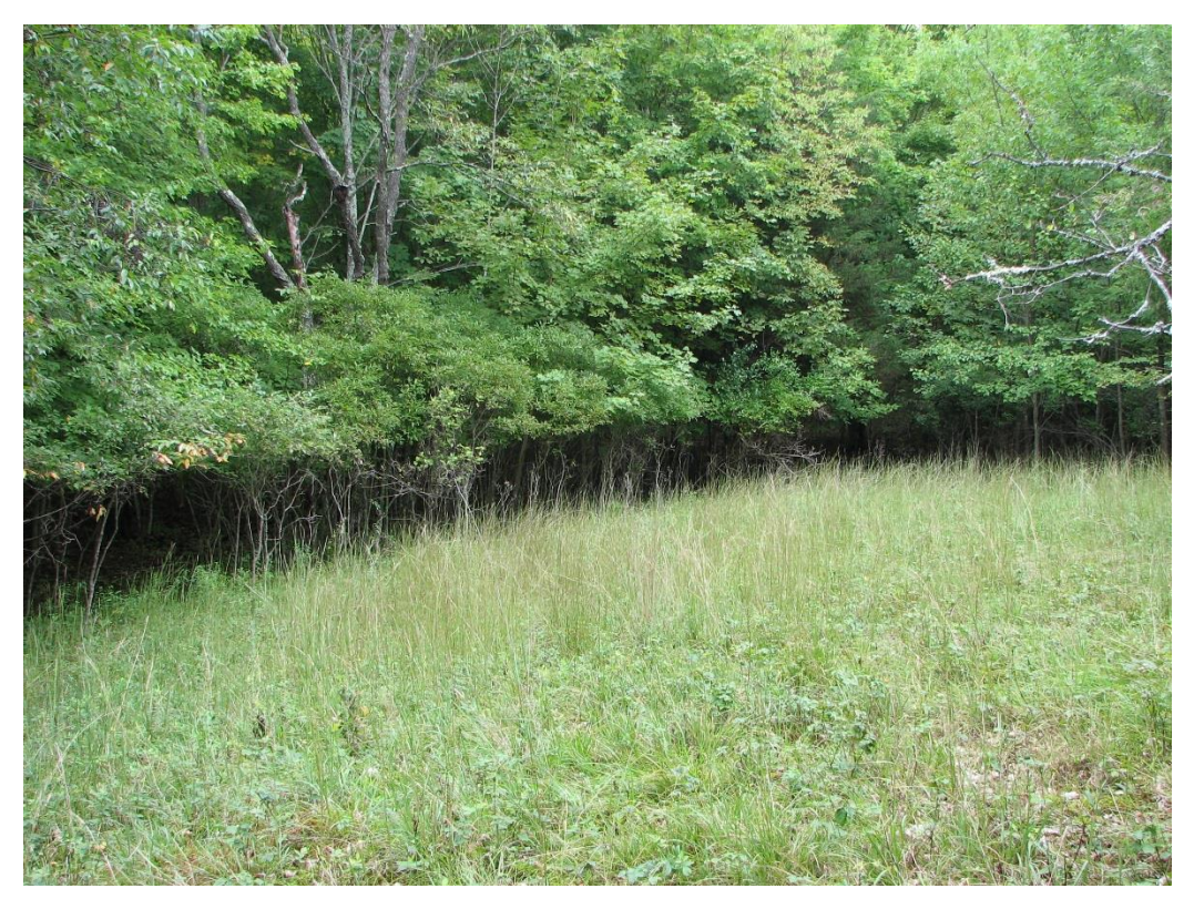
A browse line indicates that deer have eaten all the foliage growing within their reach.

High-density populations can also harm the deer themselves by increasing competition for food and transmission of diseases and parasites. Deer in lower-density populations tend to be in better physical condition (Keyser et al., 2005), all else being equal, because there is more food available to them. Because they don't come in contact with as many other deer, they are less likely to be infected with parasites or diseases (Storm et al., 2013).