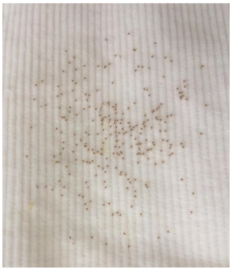
Tick-covered sampling cloth.

Measuring tick abundance without testing to determine Lyme infection rates doesn't provide an accurate indication of disease risk. However, communities interested in just monitoring tick abundance can find descriptions of various methods online.