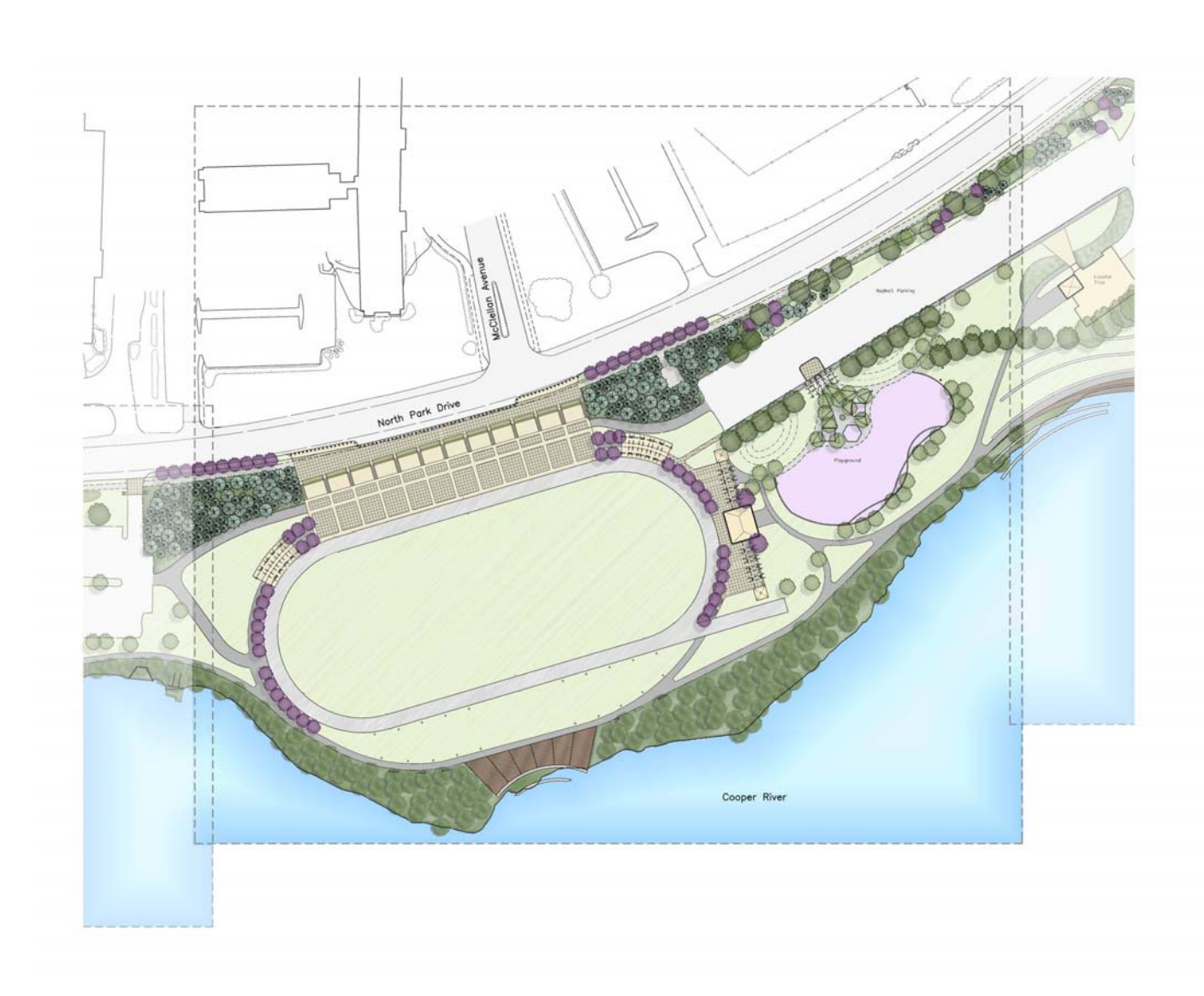
Jack Curtis Stadium and Athletic Field