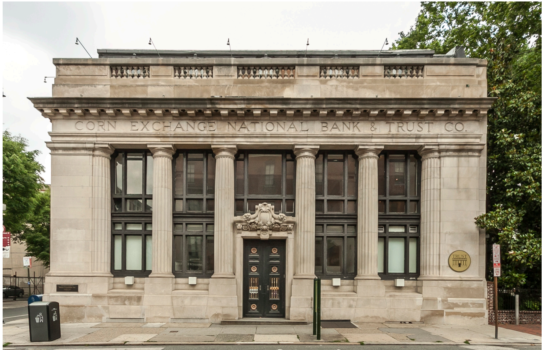
Arch Street Exterior