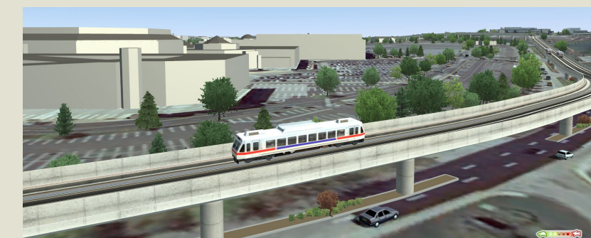
Rendering of the KOP Rail line passing by the King of Prussia Mall on Mall Boulevard.