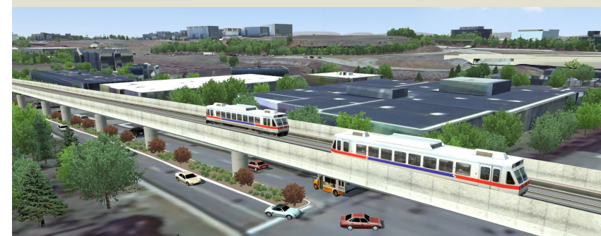
Rendering looking east as KOP Rail runs down 1st Avenue at the intersection of Moore Road, passing the King of Prussia business park.

How will KOP be different than other local rail lines? What might it look like? Come out to the March meetings to learn the details.