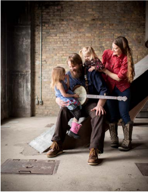
Roe Family Singers

down the road of life, two delightful innocents caught, like many Italians in 1964, between the church and Marxism. 1964, video, in Italian with English subtitles, 88 minutes.