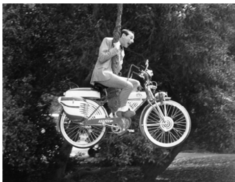
Pee-Wee's Big Adventure

The Walker Art Center is supported in part by a grant provided by the Minnesota State Arts Board through an appropriation by the Minnesota State Legislature from the State's general fund and its arts and cultural heritage fund with money from the vote of the people of Minnesota on November 4, 2008.