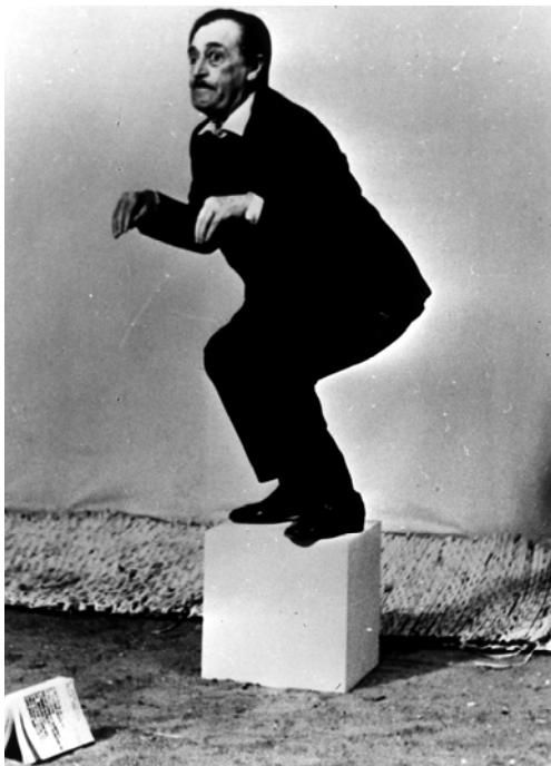
The Hawks and the Sparrows