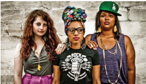
The Chalice