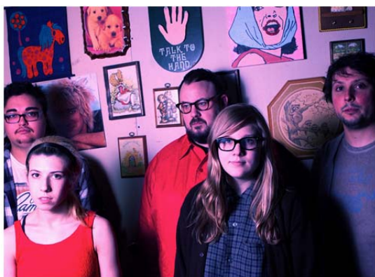
Prissy Clerks

This comic fable stars the beloved stone-faced clown Toto as an Italian everyman on an adventure with his good-natured but empty-headed son. With a wisecracking crow as a counterpoint, the human travelers progress