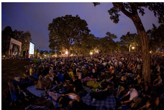
Summer Music & Movies

Minneapolis, May 21, 2013— The Walker Art Center presents Summer Music & Movies: Roadways, Monday evenings July 29–August 19. The Walker's popular perennial showcase of free films and eclectic music returns to Loring Park this summer. This year's films were selected by Mexican artist Abraham Cruzvillegas, whose work is featured in a new exhibition at the Walker. Come along on these journeys into new territory and see what you find along the way. Bands kick-start each evening—look for a mix of local luminaries and DJ hosts from 89.3 The Current spinning between the music and films.