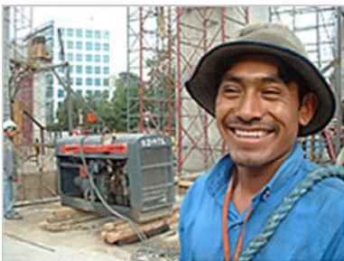
In the Pit