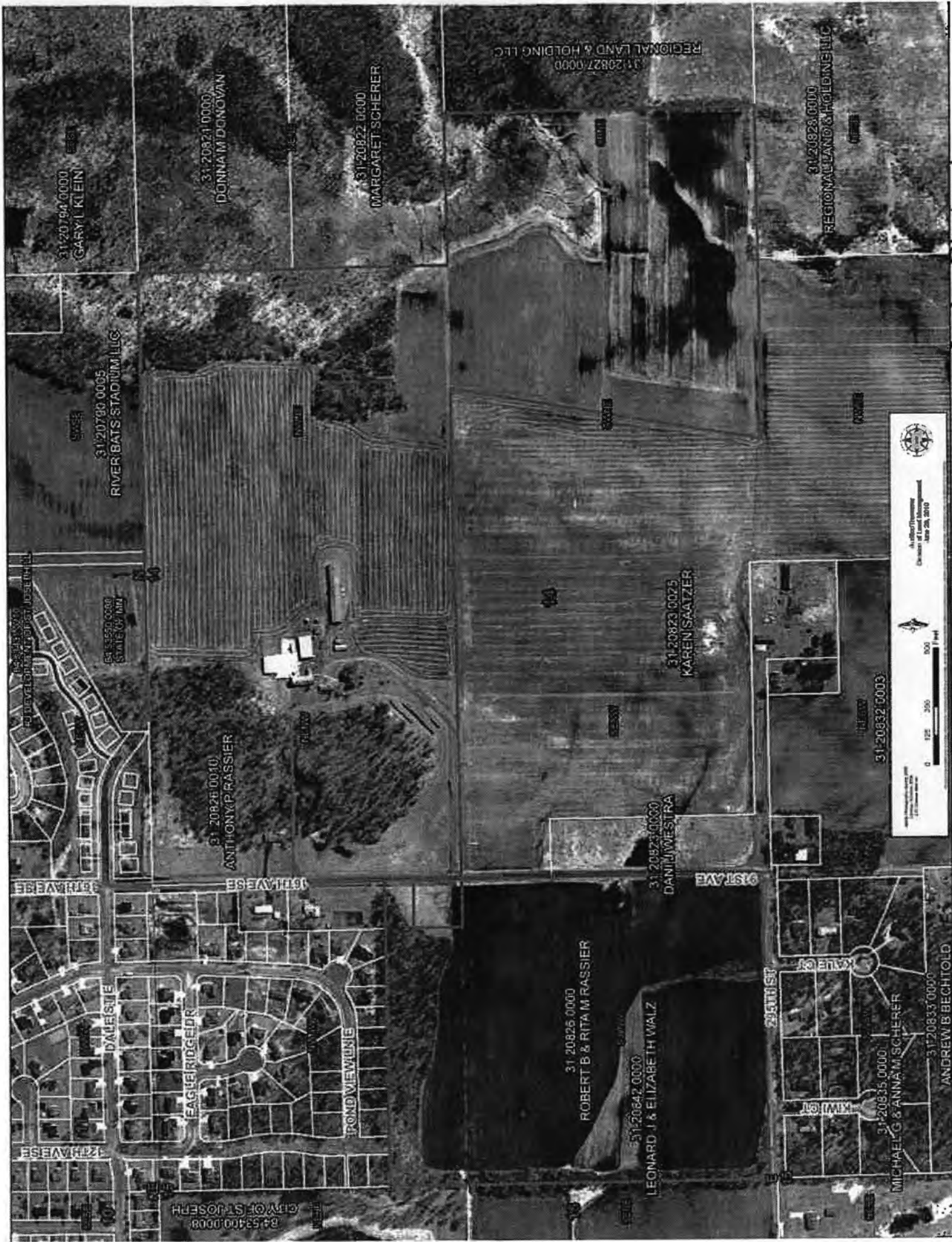
Aerial Photo A