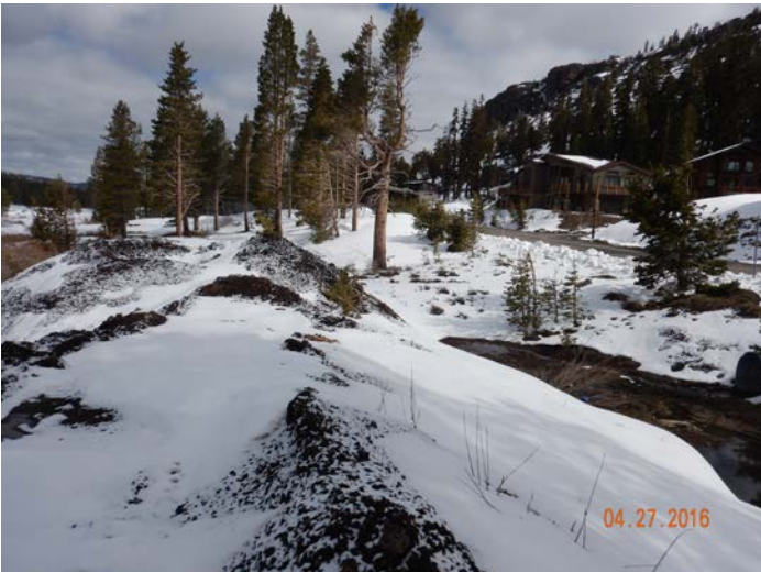
Photo 3. Large pile of asphalt grindings and snow pushed directly adjacent to the creek