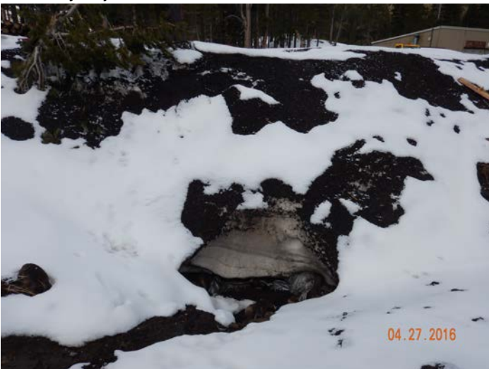
Photo 5. A mixture of asphalt grindings and snow pushed or blown into a tributary of Kirkwood Creek