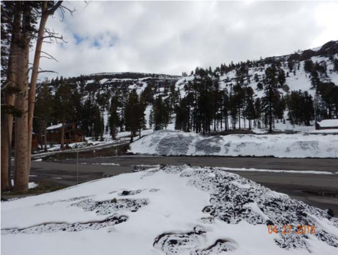
Photo 1. Asphalt grindings mixed with snow adjacent to one of the parking lots