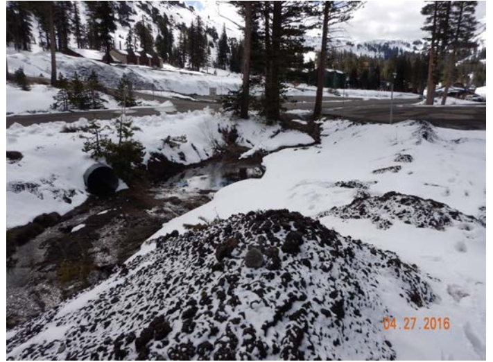
Photo 2. Asphalt grindings mixed with snow directly adjacent to Kirkwood Creek