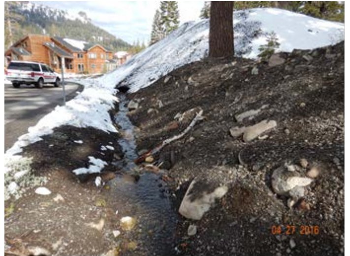
Photo 4. Asphalt grindings and snow pushed or blown into a tributary of Kirkwood Creek