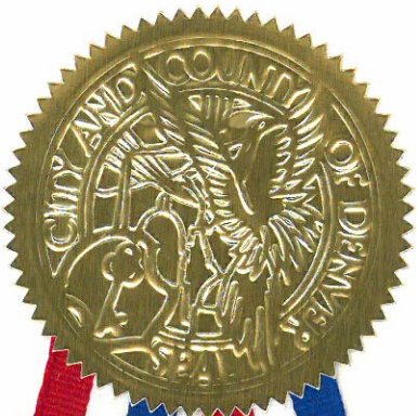
MICHAEL B. HANCOCK MAYOR

A handwritten signature in black ink, appearing to read 'Michael B. Hancock', with a long horizontal line extending to the right.