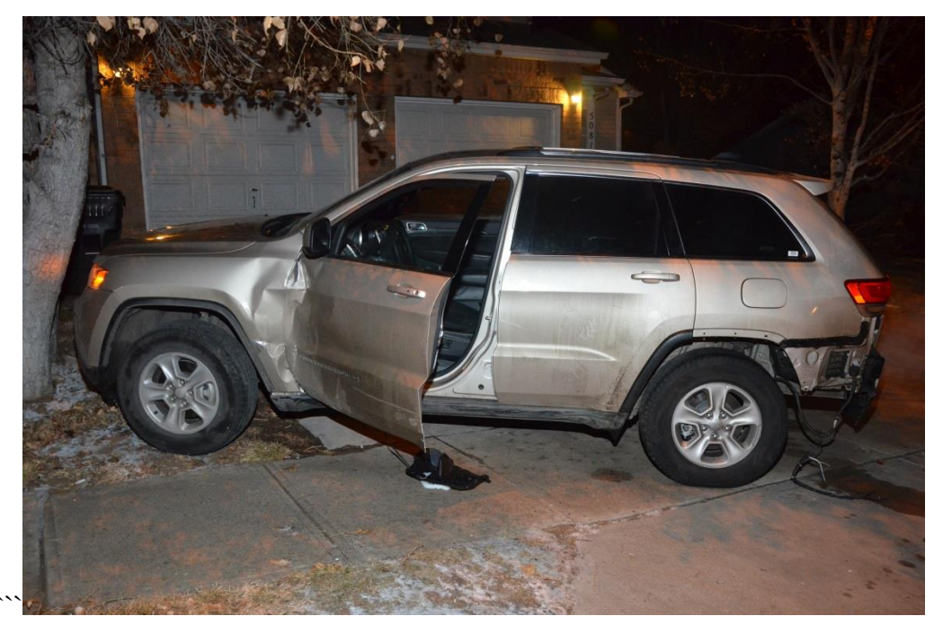
The damage to the driver's door is displayed in this photo.