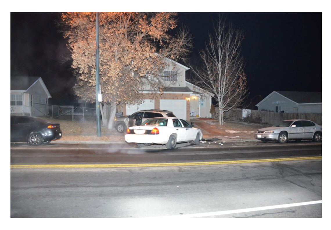
The Jeep and the police car are shown in the center of the photograph. To the right is the Chevrolet Impala the Jeep also struck.