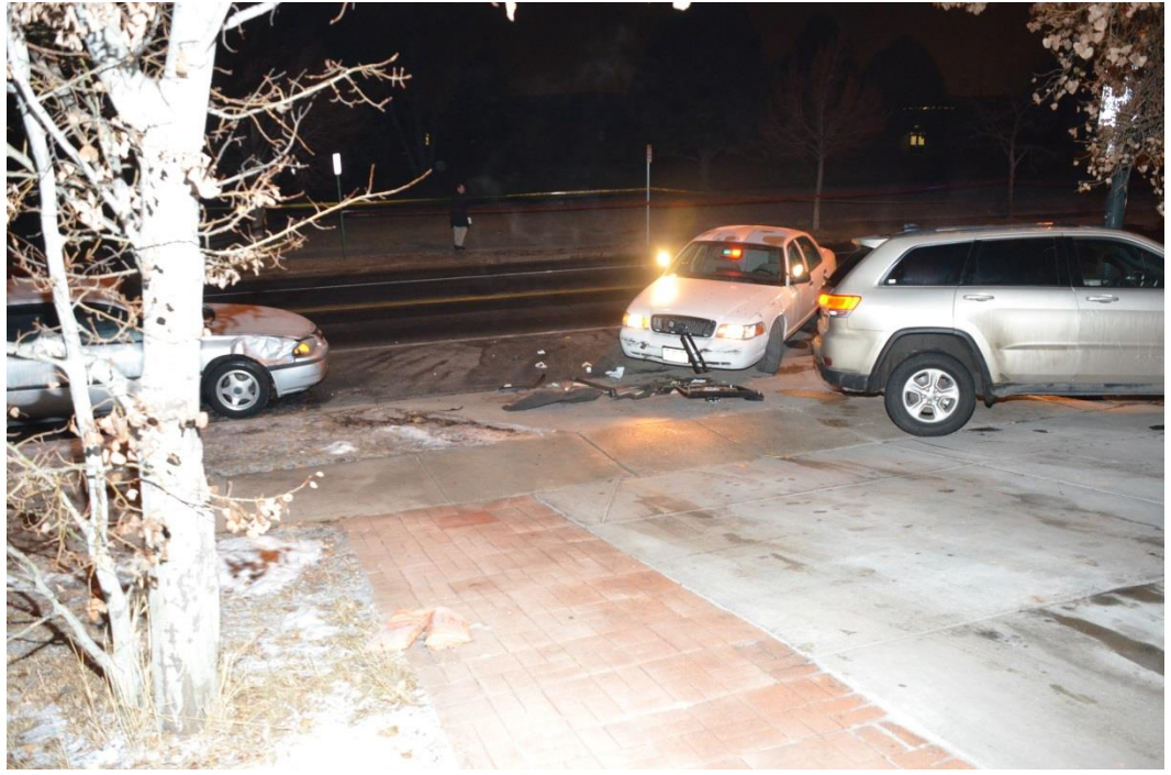
This photo shows the damaged push bumper of the police car and the collision damage to the Impala.