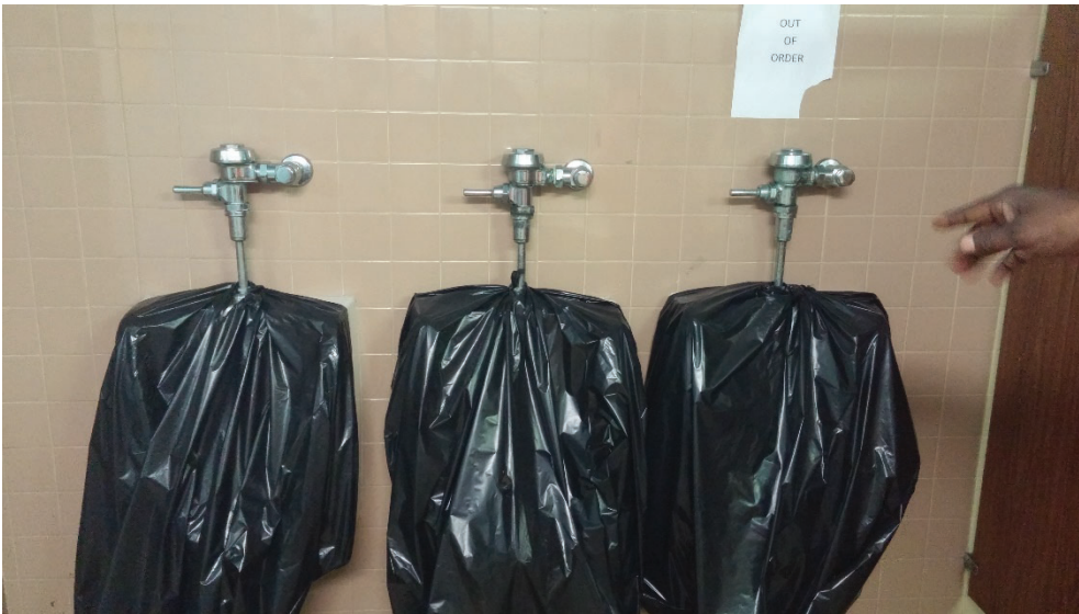
Photograph of inoperable men's urinal in the Southeast Quadrant's locker room.