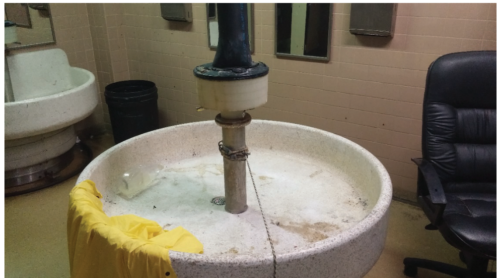
Photograph of inoperable sink in the Southeast Quadrant's locker room.