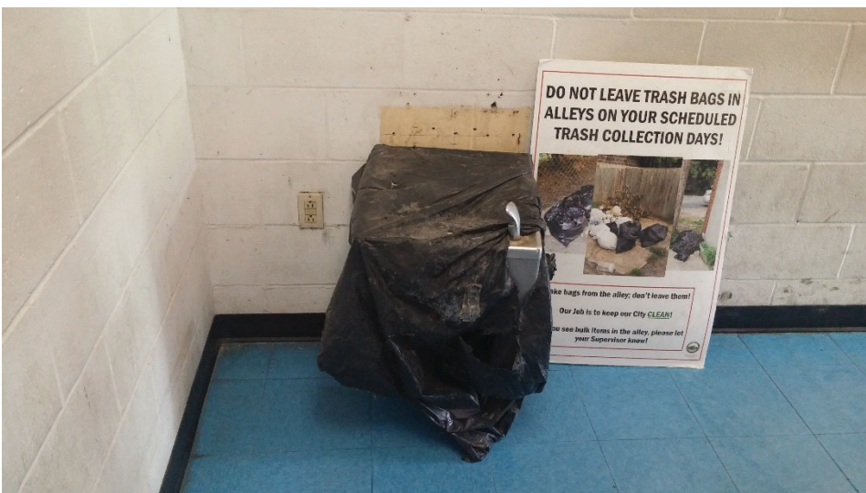
Photograph of inoperable water fountain in the Southeast Quadrant's hallway.